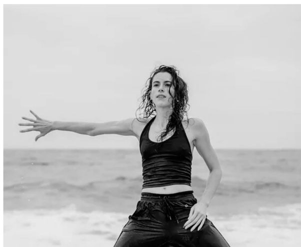
White Wave Dance Company